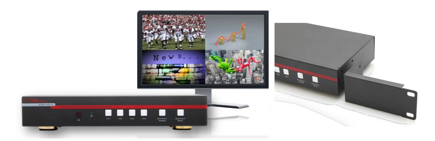
Seamless 4-Port HDMI Switch with Quad Multi-View