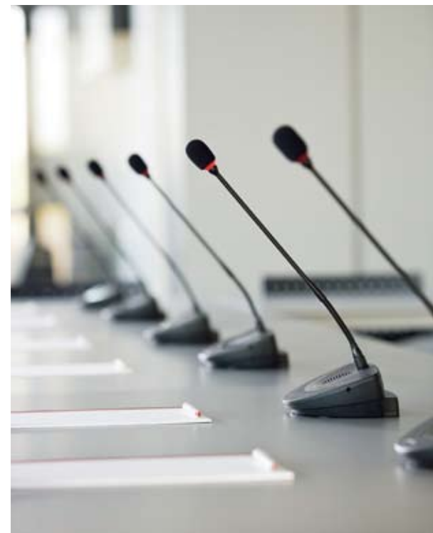
Wireless audio conferencing systems are simple to install